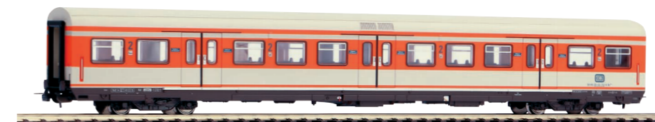
58502 passenger x-car 1st/2nd class DB era IV