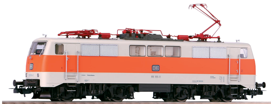
51844 electric loco class 111 suburban train Rhine-Ruhr DB era IV 51845 ~ electric loco class 111 suburban train Rhine-Ruhr DB era IV