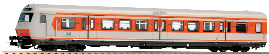
58501 x-car control car 2nd class DB era IV

In addition to the regular passenger cars with a length of 24.5 meters the trains were equipped with control cars for push-pull train service. The control cars had a length of 25.26 meters and an unladen mass of 31.100 kg. A total of 118 control cars were built for the pilot series and the four following production series and delivered to the suburban railways Rhine-Ruhr and Nuremberg together with the matching passenger cars. The control cars are equipped with a standardized driver's cab and a time multiplexed control for push-pull trains that operates through the lines of the cars and loco. While the passenger cars are equipped with four compartments, the control car has only three.